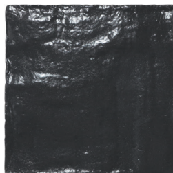
SILK DAKU SIZE: 3.9" X 3.9"