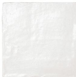
SILK SHIRO SIZE: 3.9" X 3.9"