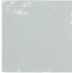
SILK MIZU SIZE: 3.9" X 3.9"