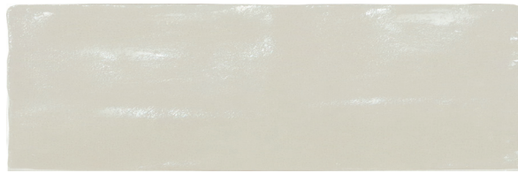
SILK MIDORI SIZE: 2.56" X 7.9"