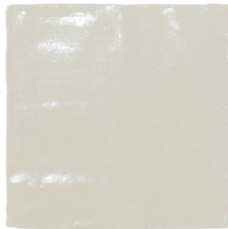
SILK MIDORI SIZE: 3.9" X 3.9"