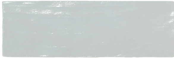
SILK MIZU SIZE: 2.56" X 7.9"