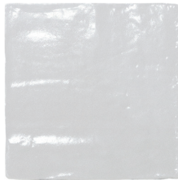
SILK GURE SIZE: 3.9" X 3.9"