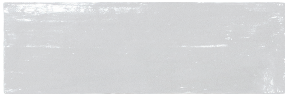
SILK GURE SIZE: 2.56" X 7.9"