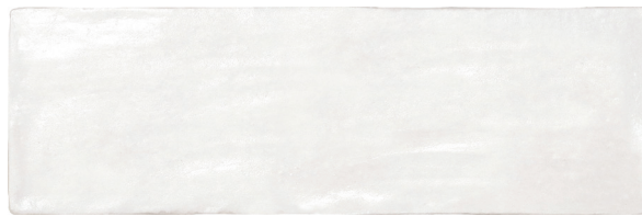
SILK SHIRO SIZE: 2.56" X 7.9"